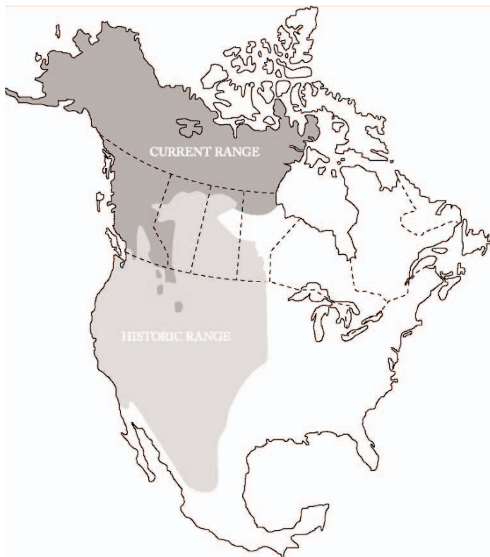
Figure 2. Current and historic North American range of Ursus arctos horribilis (Grizzly bear). Adapted from Servheen (1990).

The grizzly bear is currently distributed across approximately 26% of Canada's total land mass (~ 2.6 million km 2 ). The Prairie population of grizzly bear in Canada has been extirpated since the 1880s in the grassland portions of the provinces of Saskatchewan, Manitoba, and