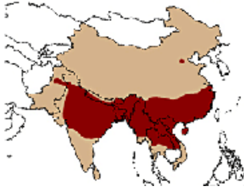
Fig. 1 World Macaca mulatta distribution. (From Cawthon), 2005.