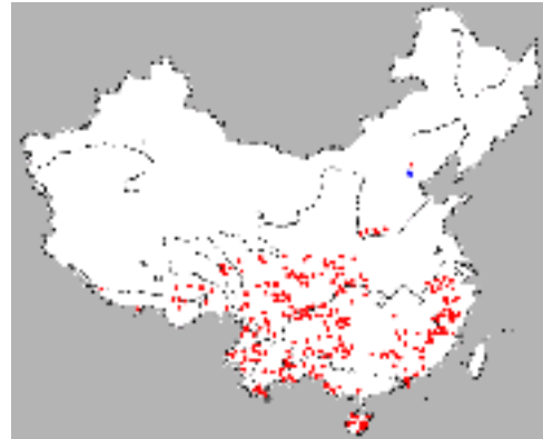
Fig. 2 Macaca mulatta distribution in China. (From Zhang, 1997)

There used to be an isolated Macaca mulatta population located at the northern edge of the distribution range of M. mulatta near Beijing in China (Fig. 2). The Macaca mulatta there were once classified as an independent species, Macaca tcheliensis , but most of researchers consider the population of rhesus monkey as a subspecies of Macaca mulatta . Quan et al. (1993) questioned whether the Macaca mulatta was native inhabitants to the place, or it might be introduced to that place by people.