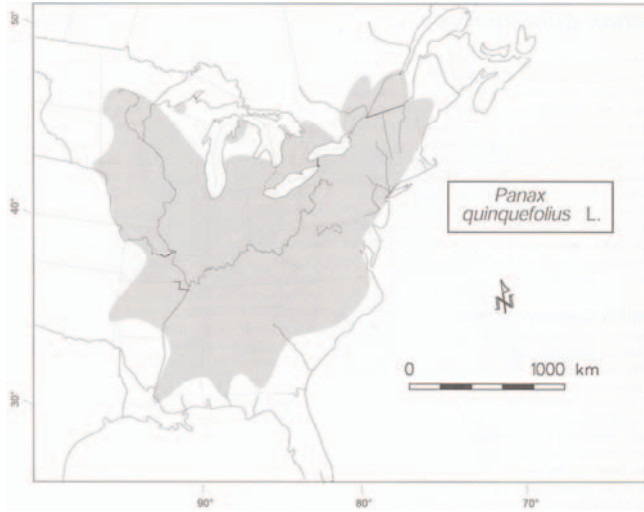
Figure 1. North American distribution of ginseng ( Panax quinquefolius ) (Small & Catling, 1999).