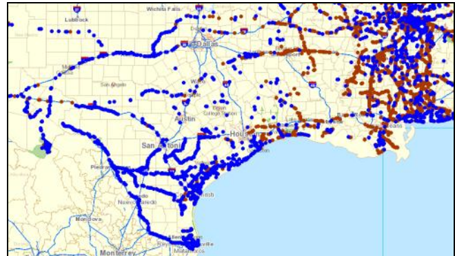
Figure 1. Cactus Moth Detection and Monitoring Network map of southern Texas and Louisiana showing host-present (blue dots) and host-absent (brown dots) data as of 14 April 2011.

on potential connectivity between coastal and inland host populations in southwestern LA and southeastern TX. Surveys from March 1 to 2 and March 8 to 11 were focused connectivity in south-central LA and southeastern Louisiana west of Lake Pontchartrain. Very little host was found during the three surveys, but numerous negative host reports were collected and entered into the Cactus Moth Detection and Monitoring Network database ( www.gri.msstate.edu/cactus_moth ) (Figure 2). Based upon these surveys, inland connectivity was not identified in the surveyed areas. No pest was found during the surveys.