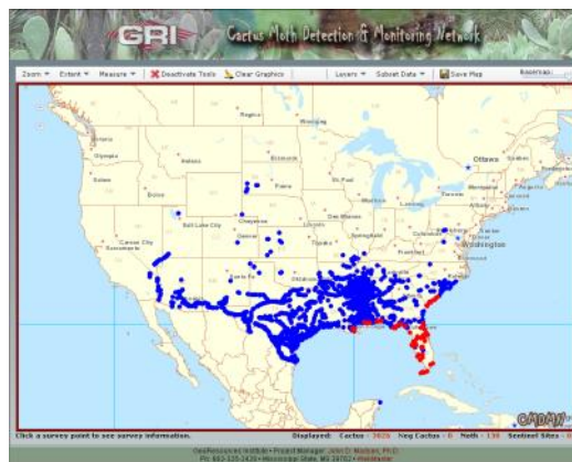
CMDMN uses a new interactive map.

Work continues on the map products provided through the CMDMN. Caching on the basemaps (the background layers providing roads and the like) is still in progress. The map cache will allow the maps to function at a much faster redraw rate. Free basemaps provided online are not typically cached at a resolution needed for CMDMN. Therefore, map caches are being built in-house to support the online maps.