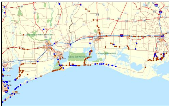
Figure 2. Cactus Moth Detection and Monitoring Network map (14 April 2011) of southeast Texas and southwest Louisiana showing the prevalence of host-absent (brown dots) data over host-present (blue dots).

Following surveys in south Texas, questions remained regarding extreme southeast Texas and southern Louisiana from southwestern Louisiana to areas east and west of Lake Pontchartrain. Areas previously surveyed along the coast in Louisiana and southeast Texas were not the target of these surveys. Three separate road surveys were conducted in early 2011. Surveys from February 21 to 25 were focused