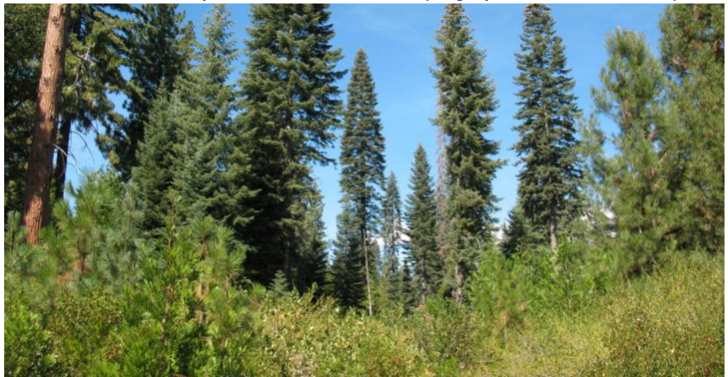
Fig. 1. Negative data is collected and entered into the Cactus Moth Detection and Monitoring Network (CMDMN) to assist with host modeling efforts. This data may also help prevent duplicate survey efforts in areas like the one pictured in Northern California.

Moth Detection and Monitoring Network database.