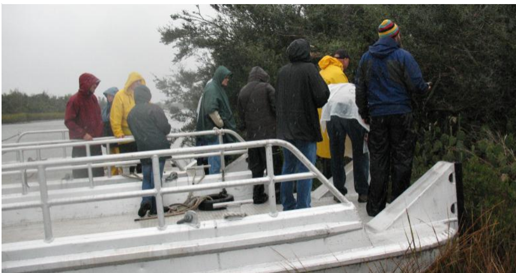
Figure 2. Technical Working Group inspecting Opuntia engelmannii Salm-Dyck ex Engelm. for cactus moth in southern Louisiana during a meeting in New Orleans to discuss potential USDA cactus moth strategic plans. MSU-GRI was one of several groups that participated at the meeting. Two of the three survey boats are pictured.

Cactus Moth was found on both Horn and Petit Bois Islands off the coast of Mississippi.