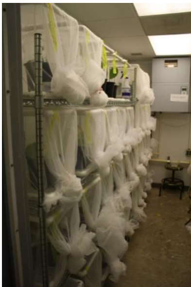
Figure 1. Growth chamber experiment in APHIS-approved quarantine facility at Lyle Entomology Building, MSU.

Our proposed work for 2009-2010 encompasses three major areas of research – continued habitat modeling efforts based