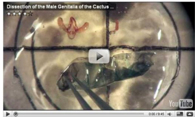
Figure 1. The first on-line video for demonstrating method for making genitalia dissections of moths.

The identification of the cactus moth can be dependent upon making dissections of the male genitalia for distinguishing this species from related cactus moths. Proper methods for making dissections are known to many Lepidoptera specialists, but these have not been made widely known to others who are involved in making diagnostic identifications. A new video has been produced that covers the tools and reagents needed for making dissections and the detailed methods for cleaning, staining, and slide mounting the abdomen